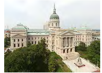
The Indiana State Capitol