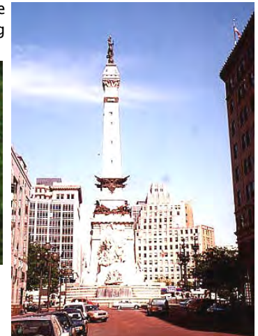
State Sailors' and Soldiers' Monument, Indianapolis