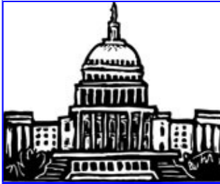
The U.S. Capitol: Washington, D.C.

For Session 8, TLC-South Bend students were offered the follow-